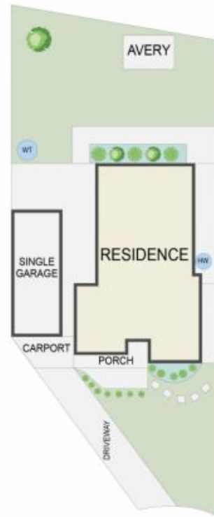
SITE PLAN APPROX. INT: 132m 2 APPROX. LAND: 538m 2