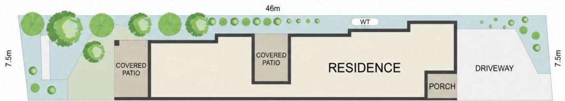
46m SITE PLAN